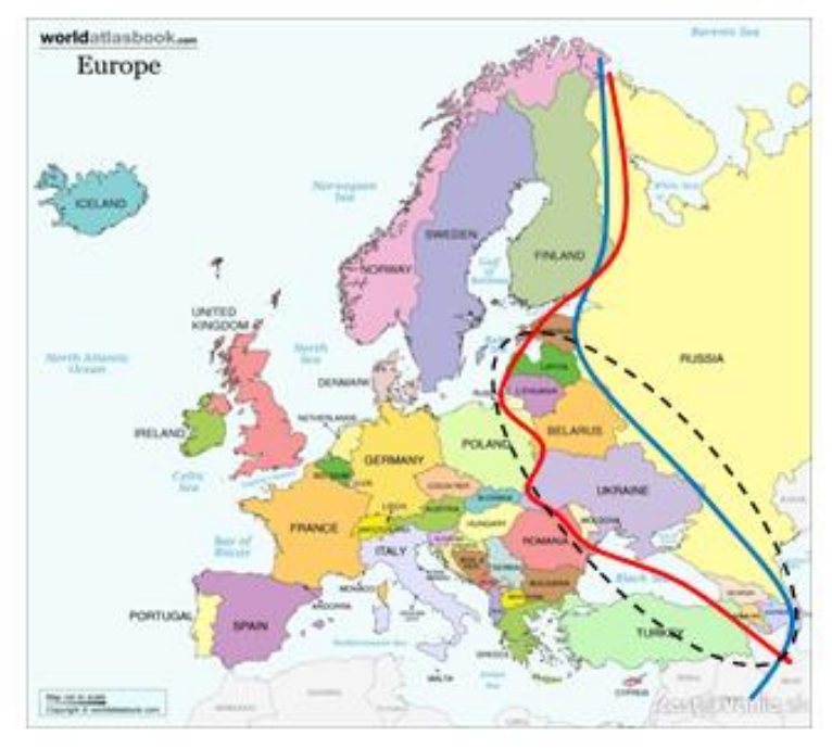
Fig. 2 Europe – geopolitical lines and geopolitical epicenter

6. New geostrategic barriers (particularly defense geopolitical barriers) are being defined and influenced by possible (and supposed) global social chaos . Global social chaos is a result of growing disparities between wealth of the "North" (the USA and European Union) and poverty of the "South" (Africa, Asia and Latin America). Increase in the number of less developed states with very low economic development, global economic crisis, huge amount of poor people and unemployed, wars and riots will violate political order in states of the "South" and support mass migration to developed states. This mass migration will violate order as well as social and political stability of developed states. Developed states of the "North" will protect their interests, social and political stability. It is a normal reaction. There are many ways how to fight mass migration. First measure is creation of various types of administrative barriers (visas and authorizations to enter the national territory). Second measure is building of protected borders and border checkpoints, creation of long completely guarded lines closely connected with strict control of free movement of illegal immigrants. It will be a very