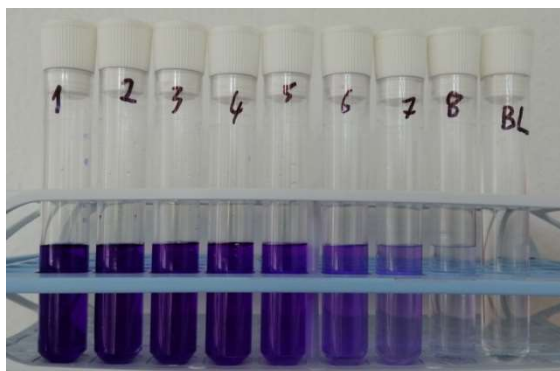
Fig. 1 Sample preparation – device A

A deidentified sample of two identical 15 ml aliquots was provided to our workplace by a partner microbiological workplace that cultivated microorganisms with their subsequent staining according to the valid standard operational procedures. We have prepared a series of nine sample tubes diluted in a ratio: 6/0; 5/1; 4/2; 3/3; 2/4; 1/5; 5.5/0.5; 5.9/0.1 and finally 0/6 (clean diluent, blank; Fig. 1). The total volume was 6 ml, diluted with saline buffer. On this line of tubes, measurements were made on device A, for each sample with 11 repetitions at a wavelength of 590 nm. Subsequently, 150 \mu l was transferred from the tubes to the microplate, with n = 11 repetitions for each dilution and n = 8 for the blank. The absorbance values of the solutions in the microtiter plate were determined on the device B at a wavelength of 600 nm (Fig. 2). Subsequently we processed the basic statistical characteristic of the data determined by the arithmetic mean, standard deviation, median, minimum, maximum and coefficient of variation.