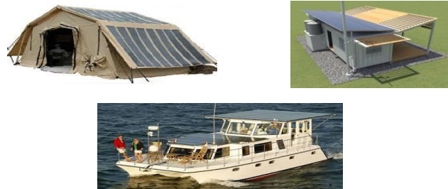
Fig. 3 Examples of using photovoltaic systems on mobile equipment [7]

One of the most ecological kinds of energies is electric energy obtained through a direct transformation of solar radiation, which has been known since the 19th century. There is a large excess of solar energy impinging the Earth's surface, however with a low density, and it is featured by a seasonal and daily variability influenced by weather as well. However majority of PV systems do not need a direct solar radiation.