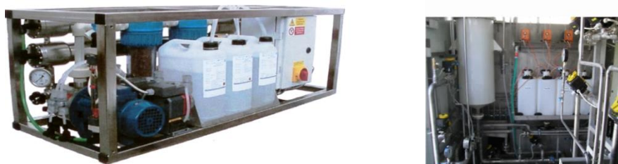
Fig. 5 Mobile versions of water treatment ( MSRO 140, SVK - MÚPV 5) [8]