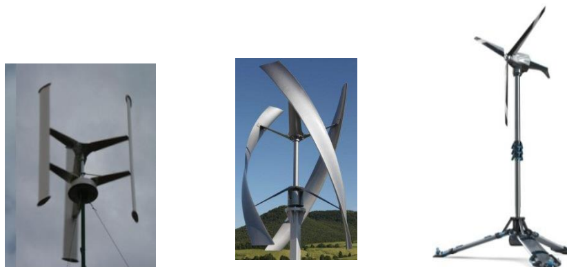
Fig. 4 The most used constructions of wind turbines: a, b – with a vertical axis, c – with a horizontal axis [7]

Recently the wind power engineering has marked a huge development with a yearly increase of output more than 30 %. Nowadays the wind power stations are routinely built with output of 1,5 - 2,5 MW. The wind turbines are used with a diameter from 0,4 m to 80 m and with output from 0,25 kW up to MW order.